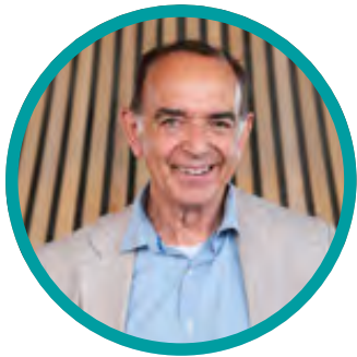
Lord Nicholas Bourne