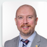
Mabon ap Gwynfor MS Plaid Cymru