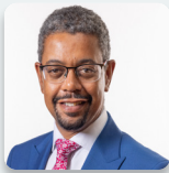
Vaughan Gething MS Welsh Labour